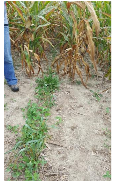
planted in bare ground