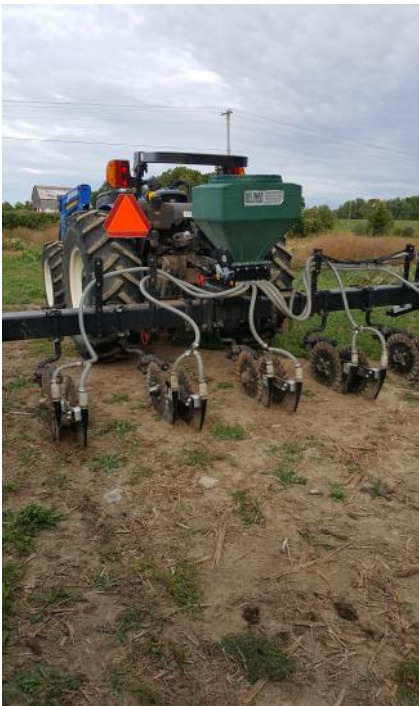
Interseeder used by Matt Porter