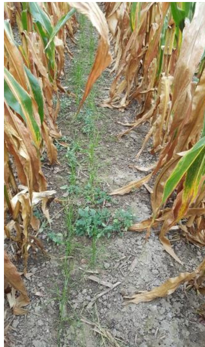
planted into corn mid June